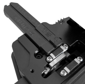
Field assembly friendly with removable jig