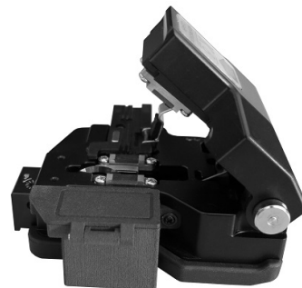
Storage off-cut collector