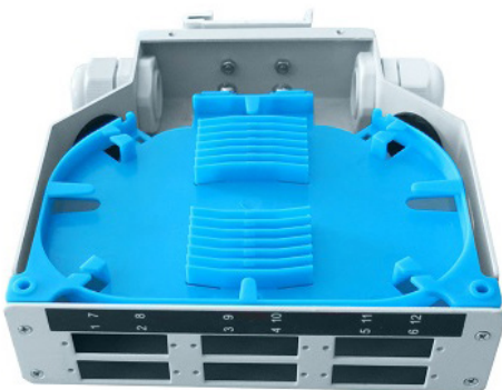
for 6 SC duplex adapters